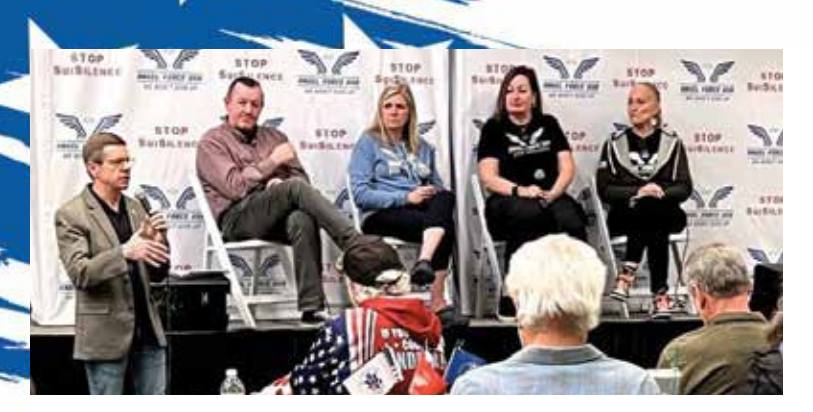
In southern California addressing the impact that veteran suicide has on families and our communities. Dixon Center is a recognized and visible network and voice for military and veteran services.

"Dixon Center for Military and Veterans Services' willingness to go to the grassroots communities and be effective and true ambassadors on behalf of our veterans who are dealing with or have succumbed to the invisible wounds of war is vital. Furthermore, it mitigates the cascading impact on friends and families."