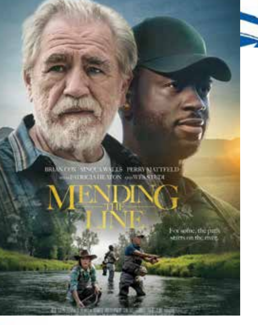
Dixon Center recognized the importance this film would have in promoting the importance of social wellness in addressing isolation and disconnection among veterans.