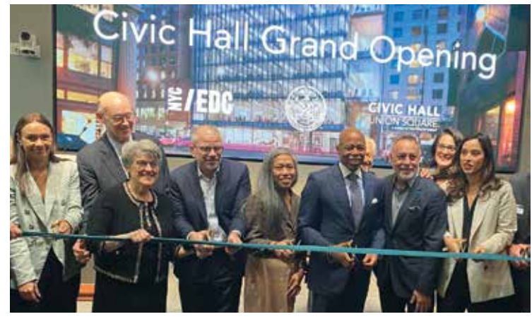
Civic Hall Grand Opening: Dixon Center is assisting Civic Hall, a leading tech training and learning center, integrate veterans and their families into their life-changing programs