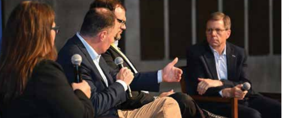
Dixon Center Team facilitating a conversation on the importance of mental health and wellness with student veterans from Columbia and Cornell University in November.