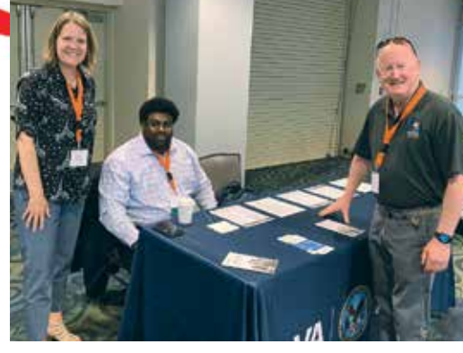
Dixon Center at the National Coalition of Homeless Veterans Annual Conference.

With this national network, we are giving veterans an opportunity— not just to survive, but to thrive.