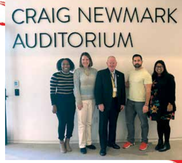
Civic Hall grand opening

Approximately 3,213,000 Organizations and Individuals Since 2012